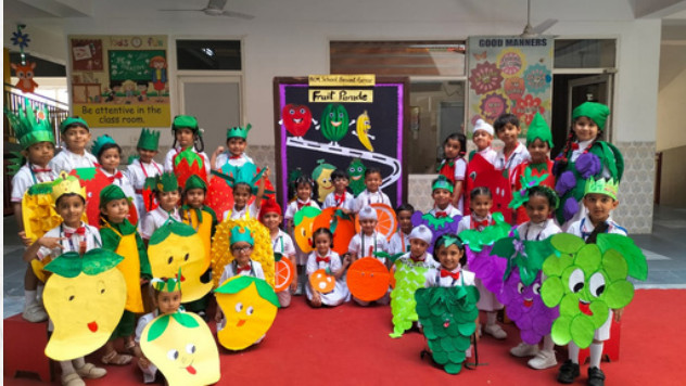
Tiny tots of Kindergarten marching in a fruitilicious parade